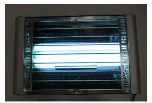
Figure 5: Ultraviolet light trap.

Sticky fly papers or ribbons are effective at eliminating a few flies in relatively confined areas, but are not effective enough to manage heavy infestations or to provide control in an outdoor setting. Traps containing fly food attractants can be readily purchased commercially and may remove large numbers of flies when they are not competing with nearby garbage or animal waste. However, the fly attractants used in these traps are quite foul smelling and these traps should be placed at some distance from occupied structures. Fly traps using ultraviolet light as an attractant may be effective when used indoors where they are not competing with daytime sun light, and there are some commercially available models designed for the home or office that present a nice appearance and contain a hidden glue board (Figure 5) onto which attracted flies will become entangled. Of course, for control of just a few flies, the time tested fly swatter is always appropriate! But, do not swat flies in food preparation areas as food may become contaminated with insect body parts.