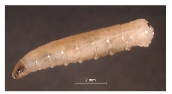
Figure 3: Lateral view of third instar house fly larva.

pupa. The pupa develops within a puparium which is the hardened outer skeleton ("skin") of the last larval instar. The puparium looks superficially like rodent feces; brown in color and with an oval shape. However, the ends of a puparium are rounded rather than tapered as for most rodent feces and regular striations are notable on the surface (Figure 4). Within the puparium, the pupa transforms into an adult fly. The rate of fly development is dependent upon external temperatures; under optimal summertime conditions, house flies can complete